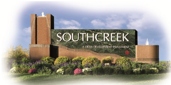
Building XIV—13220 Metcalf

Available 8/2018 Great Space with Golf Course Views! On-Site Property Management