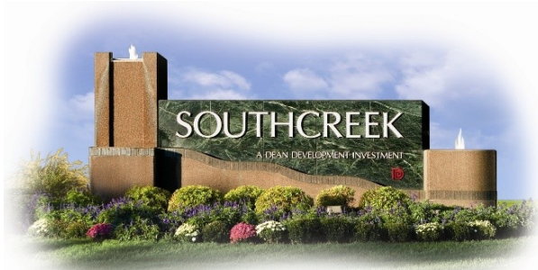
Building I—12900 Metcalf

Sublease Now Available! Move-In Ready Term Thru 6/30/21 Great Corner First Floor Suite