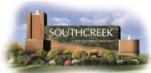
Building XIV—13220 Metcalf