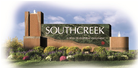
Building VII—7311 W. 130th St.

New to Market Offices on Glass Large Conference Room Great Open Area With Windows