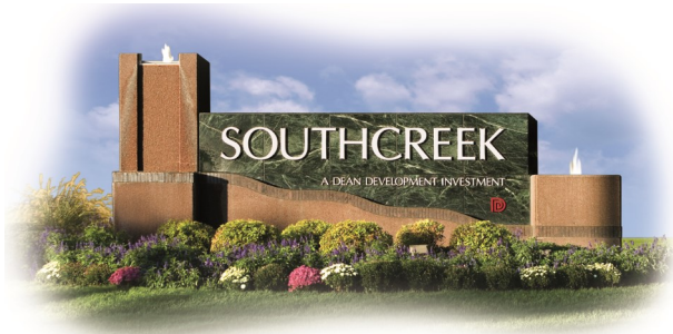
Building XIV—13220 Metcalf