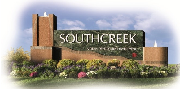
Building VII—7311 W. 130th St.

2,645 RSF 1-Story Building Open Work Area Great Floor to Ceiling Glass Offices