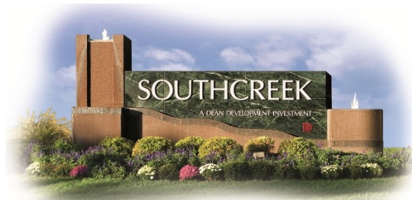
Building XIIB—7400 W. 132nd St.

Available Now 977 RSF Fantastic First Floor Suite On-Site Management