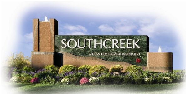
Building IVb—7304 W. 130th St., OPKS

2,554 RSF New To Market! 5 Offices on Glass Conference Room Close to Amenities Walking Access to Lake