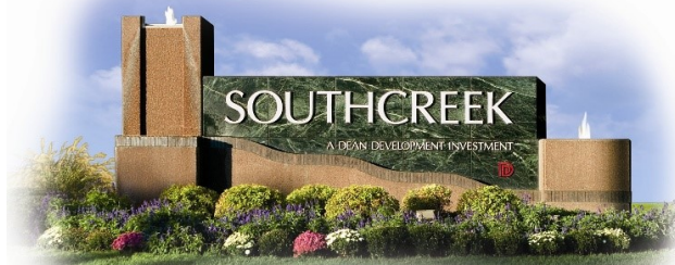
Building I, 12900 Metcalf

800 RSF 2nd Floor Suite Windowed Offices On-Site Management